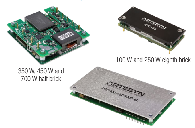
600 W, 700 W and 800 W full brick