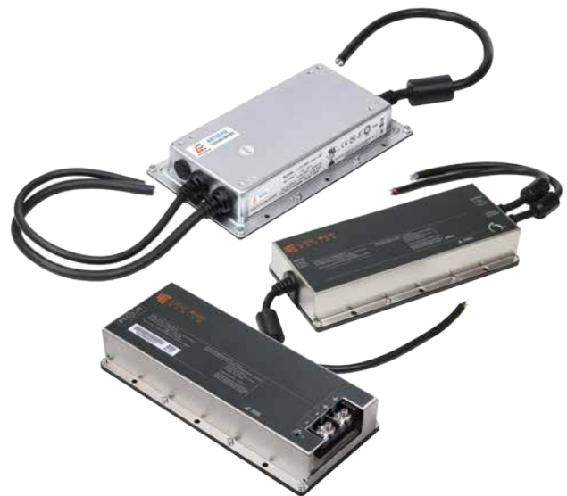
Fig. 1: A new category of AC-DC power supplies, such as Artesyn's enclosed LCC250 and LCC600 series, is optimized for conduction cooling and fanless operation up to 85°C baseplate temperature

The problem, then, is how to deliver a low-cost, ruggedized power supply which can operate at full power at high temperature, but without requiring a fan.